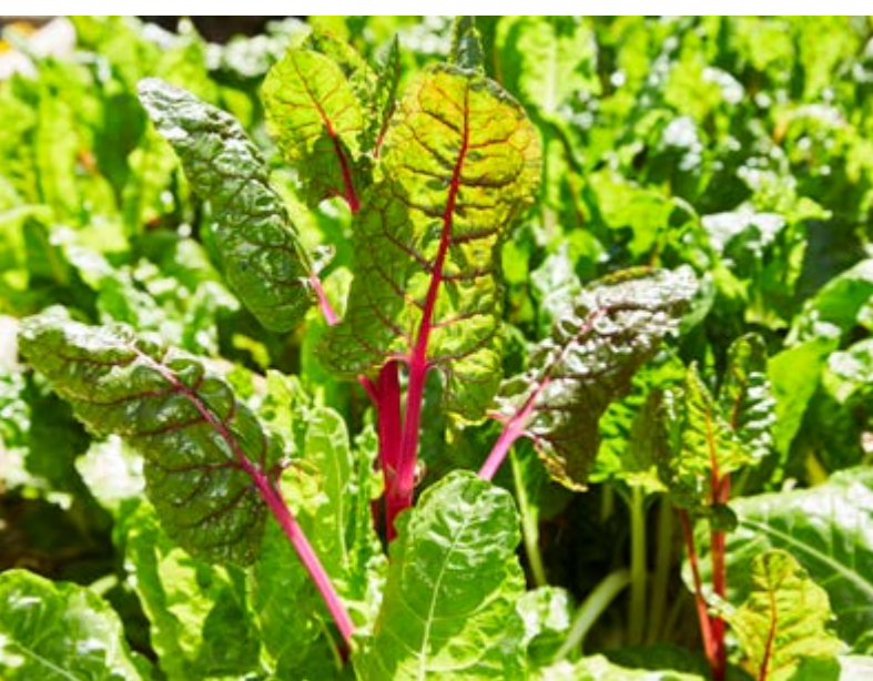
1. Seasonal organic produce grown within the one-acre urban school garden. 2. Gardening together fosters respect and trust within the group.

Gardening provides a context for children to learn and develop. This is typically articulated in terms of: fostering a connection to nature; developing motor, social and technical skills; encouraging a healthy lifestyle and instilling a sense of citizenship and connection to broader communities. Evidence shows these have a positive impact on children's overall wellbeing. There is also a growing body of evidence that suggests children's wellbeing is positively affected by their active participation in education. This participation often involves students actively contributing to their learning environments, being in dialogue with decision makers (typically adults), and working together with other students and teachers to make positive contributions to school life. This article reports on the activities of one senior secondary urban school gardening program in Australia where students co-design and manage a one-acre food garden. The findings reveal unique opportunities the garden provides for students to actively participate in ways that best suit their learning styles; take an active role in sharing power and decision-making alongside adults and peers; and contribute to their school and community. This positively influences their overall wellbeing. The garden also provides students with a much-needed opportunity to retreat from busy school and life schedules, an important positive influence on their sense of wellbeing.