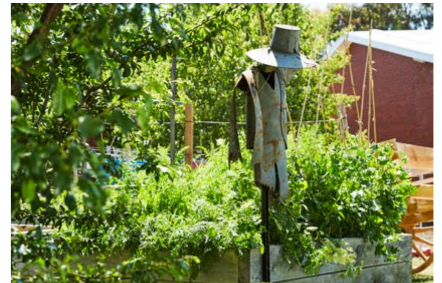
4. The garden sits proudly in the centre of the school's urban campus.